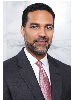
Lonnie T. Brown Jr. Student Bar Association Professionalism Award