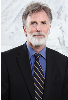
Russell C. Gabriel Eleanor C. Lanier Award for Excellence in Clinical Education