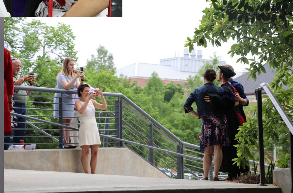
Photo ops on outside the coliseum