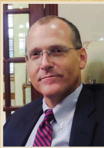
Graduates on Giving