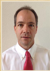
Graduates on Giving