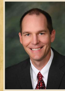
Graduates on Giving