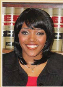
Graduates on Giving