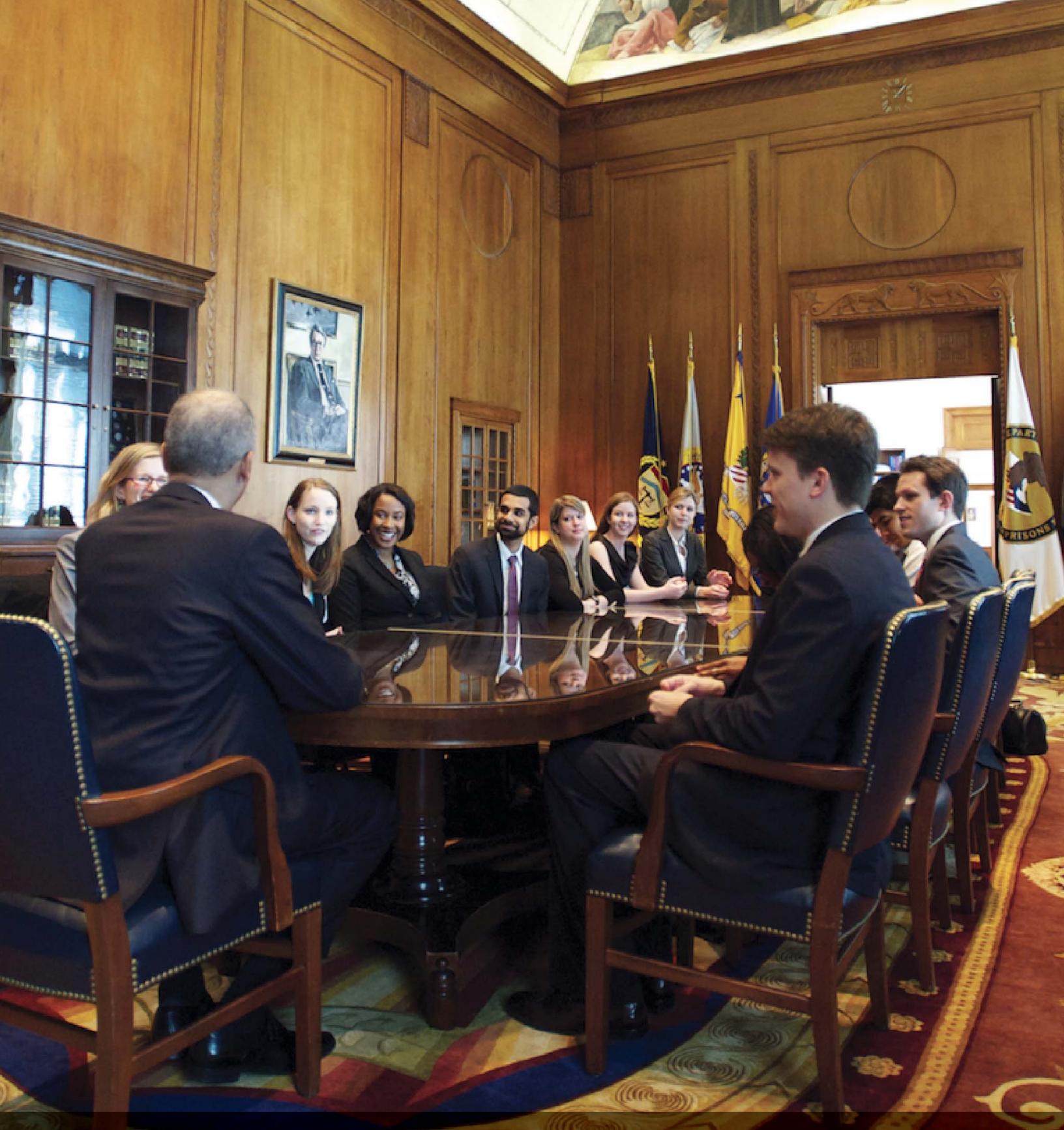
Georgia Law offers 13 civil and criminal experiential learning programs, including the Washington, D.C., Semester in Practice Program, where students have had the chance to meet with U.S. Attorney General Eric Holder.