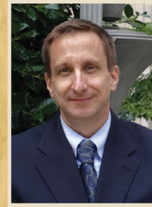
Graduates on Giving