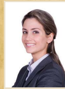
Graduates on Giving