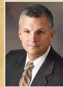
Graduates on Giving