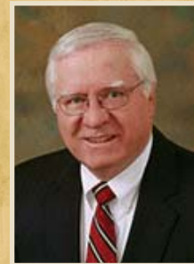
Graduates on Giving