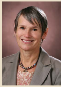
Faculty on Giving