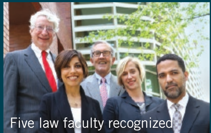
Five law faculty recognized

By combining text analysis, network analysis and visualization, the project will provide insights into how libraries can take on new roles supporting access to government and legislative information and data.